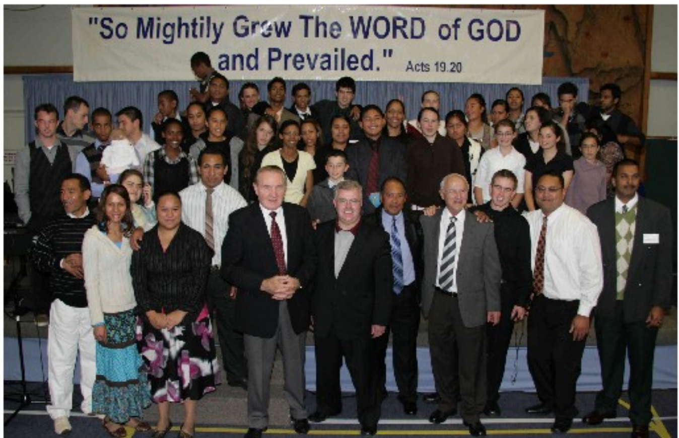
The 2009 Easter Auckland Convention Team

From Chris Sukkel "We all thoroughly enjoyed the convention. Rachael and I felt we were seated in heavenly places and really noticed the difference in 'atmosphere' when travelling home and mixing with the world again."