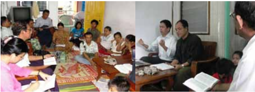
House meetings: Hungry souls settle in a small sala to hear the Message.

We are praying for a continued follow ups soon as Myanmar believers are now ready to reach out quoting, "It's now time to run with the Message."