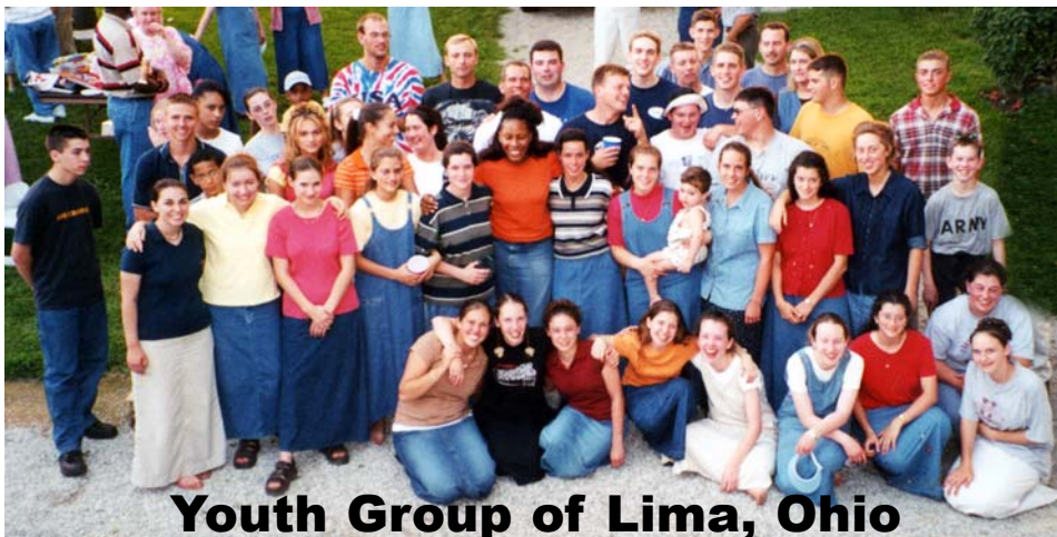
Youth Group of Lima, Ohio